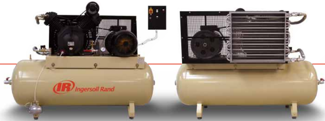
Premium Range Illustrated

11 bar receiver mounted, 14 bar base mounted.